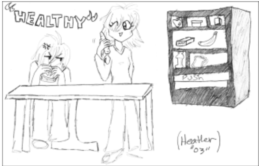
Illustration by Heather N.

It has been known for quite a while that obese people have high levels of C-reactive